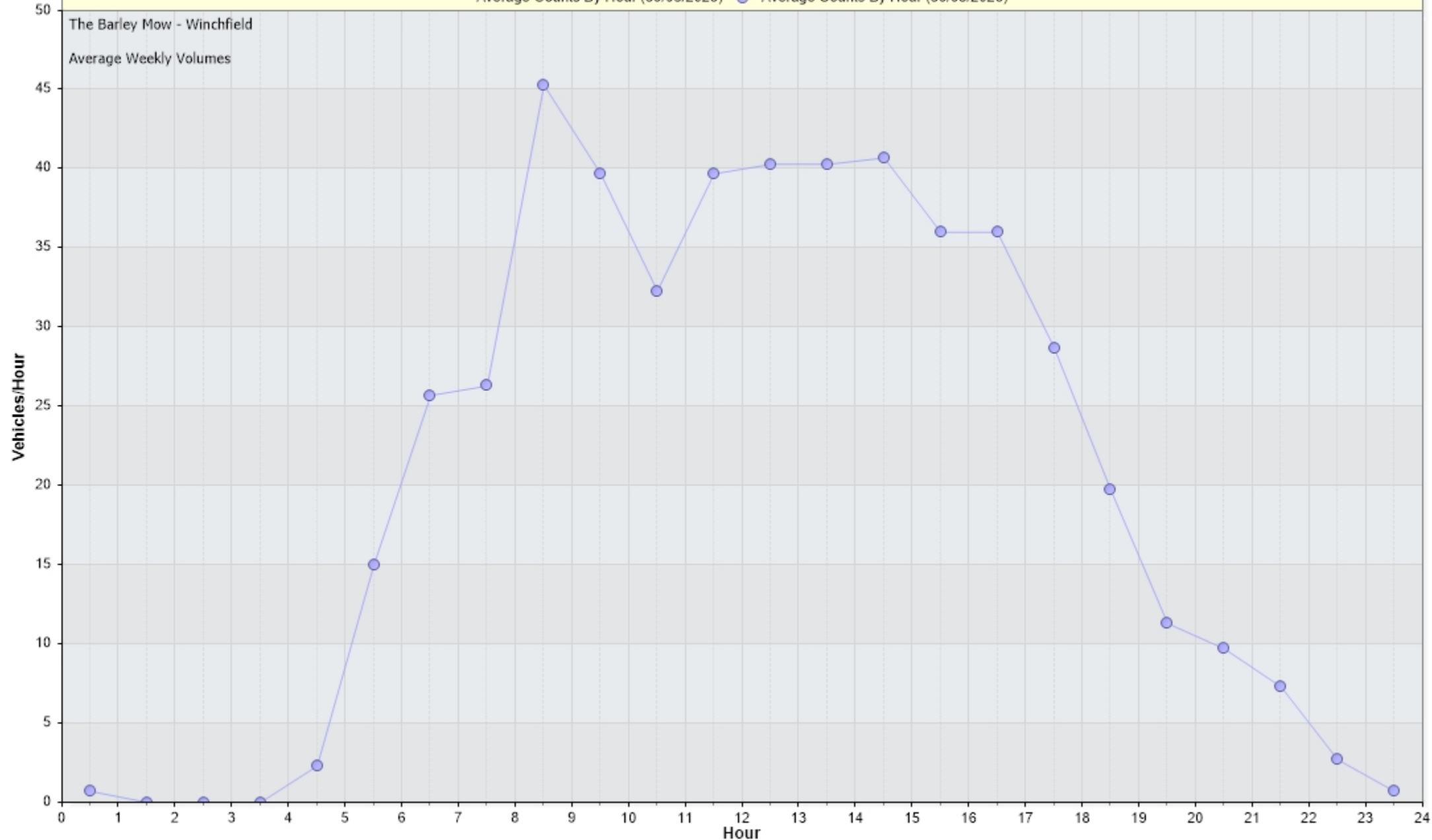
Incoming: Average Hourly Volume for Week of 30/03/2026 Average Counts By Hour (30/03/2026) — Average Counts By Hour (30/03/2026)